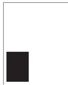
1/4 PAGE 3.2 X 3.75